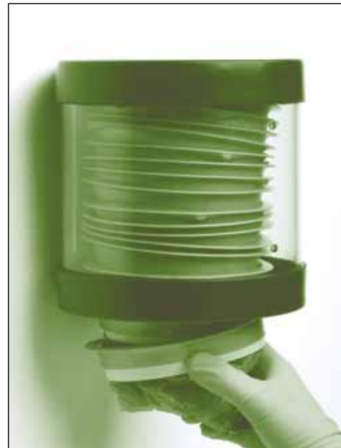
Convenient dispenser available