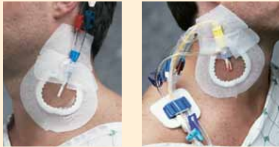
Compatible with virtually any catheter type and setup

Two different tape patch options now available