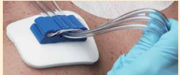
Tubing Anchor eliminates line stress

Centurion® Medical Products has a long-standing commitment to providing clinical solutions through superior product designs. Our team of design experts are continually improving our unique and comprehensive system of dressings through direct dialogue with end users. We strive to be innovative and reliable in order to meet the needs of both caregivers and patients.